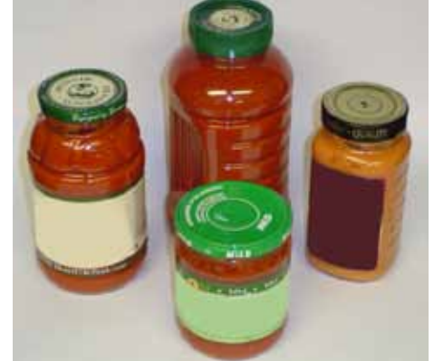
▲ Product tested, vacuum sealed glass jars

Vacuum Inspection Test: Sample Containers were made by manually drawing vacuum in each container using a vacuum pump. Samples were made with vacuum levels ranging from 0”Hg to 10”Hg (0-5 psi). The samples were then tested fifteen times each using a TapTone acoustic sensor. The graph below shows the merit value difference between a container with no vacuum or very low vacuum and a container with the target vacuum level of 9”-10”Hg (4.5-5 psi).