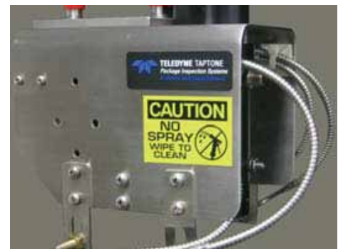
▲ TapTone Acoustic Sensor

The TapTone Acoustic Sensor measures pressure or vacuum in containers that do not have a measurable lid deflection - such as beer bottles, coffee bricks, plastic jars with composite closures and milk-based drinks in steel cans. The acoustic sensor works by applying a “tap” to the top of each container. The tone response is directly proportional to the pressure or vacuum inside the container. The frequency of the tone is measured and compared to user-set reject limits. Containers outside the limits will be rejected. The acoustic sensor is used on metal lids or crowns where the product does not touch the lid.