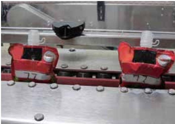
▲ Flexible drink pouches pass through the compression belts of the PRO Series DSC-TB

The purpose of this test was to prove the effectiveness of the DSC-TB pouch inspection sensor in testing flexible pouches for leaks. Leaking pouches can offer contamination a point of entry into your product, which can cause product spoilage and potential health concerns for your consumers. The DSC-TB sensor can test stand-up or gusseted pouches either hot or cold filled. Then DSC-TB Sensor is ideal for finding potential leakers in flexible drink pouches in the seams or fitment closure before they leave your processing plant.