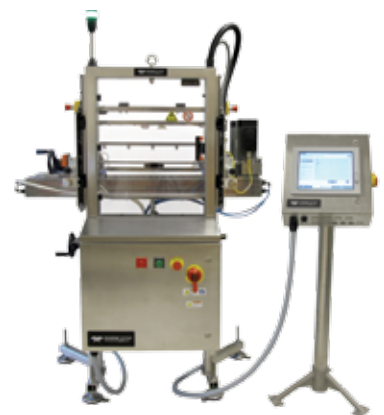
▲ TapTone PRO Series Pouch Inspector

Utilizing advanced DSP technology the TapTone PRO Series controller analyzes each of the individual sensors as well as their comparative measurement and assigns three resulting merit values to each pouch. If any merit value is outside of the acceptable range, a reject signal activates a remote reject system.