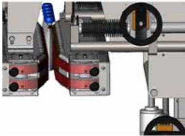
◀ The Twin Belt (TB) conveyor set is designed specifically for stand-up pouch inspection.