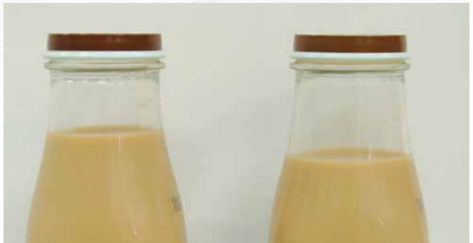
Full container (left), underfilled container (right).

X-ray technology is used to measure the product fill level in steel, aluminum, glass, plastic and paper containers. An X-ray tube energized at high voltage is used to produce a low energy X-ray beam. This X-ray beam is focused to look through the container in the expected fill level region. As the X-ray beam penetrates the container, it is attenuated by the amount of product blocking the beam. The beam is monitored by a scintillation detector, which counts the X-ray intensity after it goes through the container. The level of intensity is proportionate to the fill level of the container. User set rejection limits defines the high or low fill threshold.