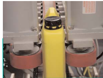
Bottle being tested with the T1000-C