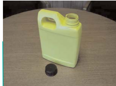
Plastic antifreeze bottle

The T1000-C Compression Sensor is ideal for finding potential leakers in antifreeze containers before they leave the processing plant.