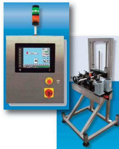
T-1000 Compression Controller and Sensor. Sensor has a cantilever design that suspends over the existing conveyor.