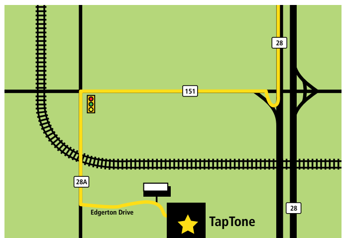
C Directions from Rt. 28 exit to facility