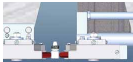
▲ TapTone T4000-DSC-LP Low Profile