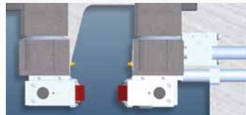
▲ TapTone T4000-DSC Standard Profile

Detects and rejects leaking and damaged flexible containers at production line speeds up to 1.52 m/sec (300 ft/min). The system is designed with dual parallel belts suspended over the customer's existing conveying system. As the container passes through the system, the dual parallel belts apply force to the sidewall of the container. This action compresses the headspace of the container which allows a comparative measurement to be taken at both the infeed and the discharge of the system. Comparing readings on the same container at the infeed and discharge of the system eliminates the effects of typical product and container variations.