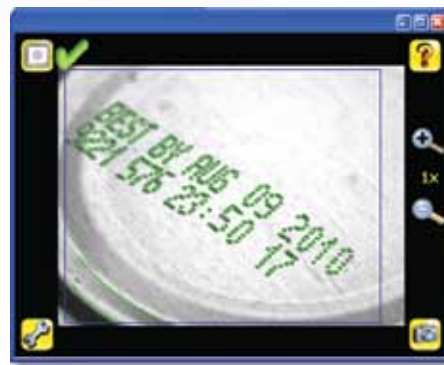
Can end with date code