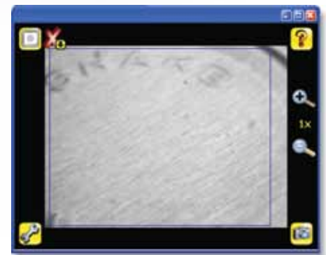
Can end missing date code