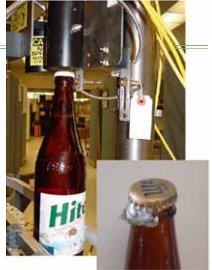
▲ A beer bottle passes under the inspection station of the T500-AC. The inset shows a crown defect.

Tested with: TapTone 500-AC Acoustic Sensor with Cocked Crown Option