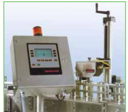
▲ TapTone 500-A Acoustic Sensor

The cocked crown detector is an optional sensor for the T500-A to increase the detection and rejection of damaged crowns. It works by measuring the crown curvature with an analog proximity sensor and comparing it to the curvature of a good crown. If the detector determines that the measured crown is outside of a predefined set of criteria, a reject signal is sent to the T500 controller to remove the bottle from the production line.