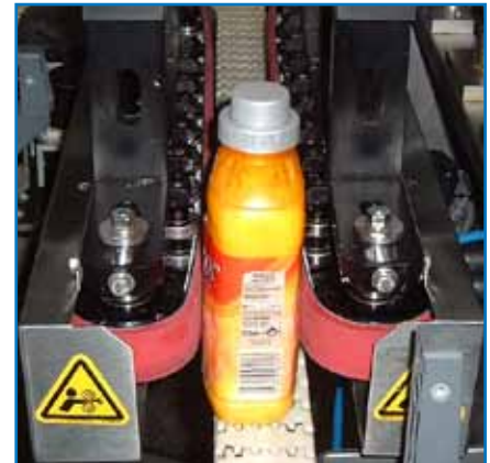
▲ A bottle of fabric softener passes through the compression belts of the T4000-C.

The purpose of this test was to prove the effectiveness of the TapTone 4000-C Compression Sensor in testing plastic household chemical bottles for proper closure and seal defects. Due to the nature of liquid household chemicals, processors are aware that one leaking container can ruin an entire case of product. Detecting leaking containers just outside the capper also prevents downstream equipment from being contaminated with leaking product. The T4000-C Compression Sensor is ideal for finding potential leakers in household chemical containers before they leave the processing plant.