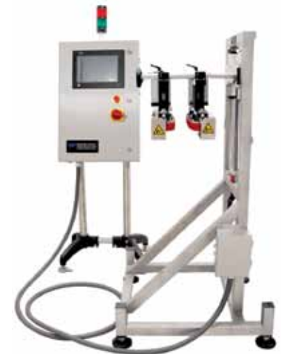
▲ T-4000 Controller and Compression Sensor. Sensor has a cantilever design that suspends over the existing conveyor.

The T4000-C Compression Sensor utilizes dual parallel belts to apply force to the sidewall of a passing container. This action also compresses the headspace of the container which allows a sensor to take a pressure measurement at the discharge of the system. Utilizing DSP technology, the controller analyzes the measurement and assigns a merit value to each container. If the merit value is outside of the acceptable range, a reject signal activates a remote reject system.