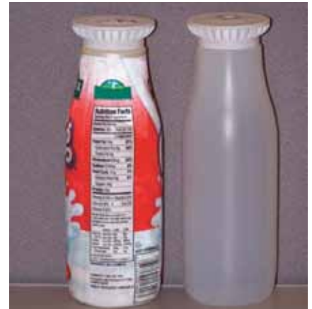
▲ HDPE Milk Chug Containers

Tested with: TapTone 4000 Dual Sensor Compression System