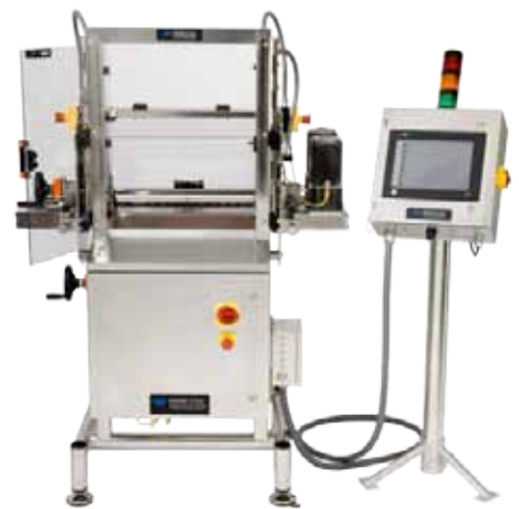
▲ T4000-DSC (Dual Compression System)

Utilizing advanced DSP technology the T4000 controller analyzes the comparative measurement and assigns a merit value to each container. If the merit value is outside of the acceptable range, a reject signal activates a remote reject system.