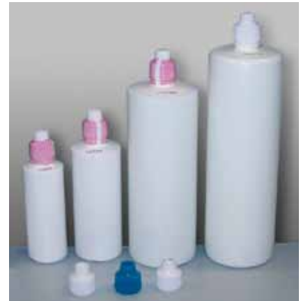
▲ HDPE eye wash bottles

Tested with: TapTone 4000 Dual Sensor Compression System